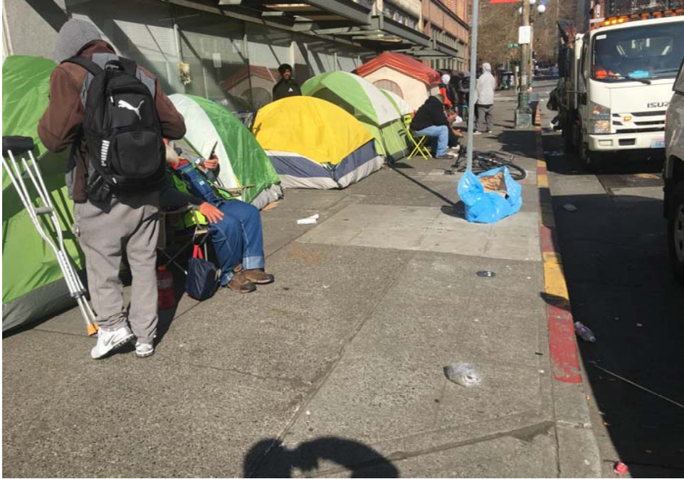
Exhibit D - Clean Up Photos